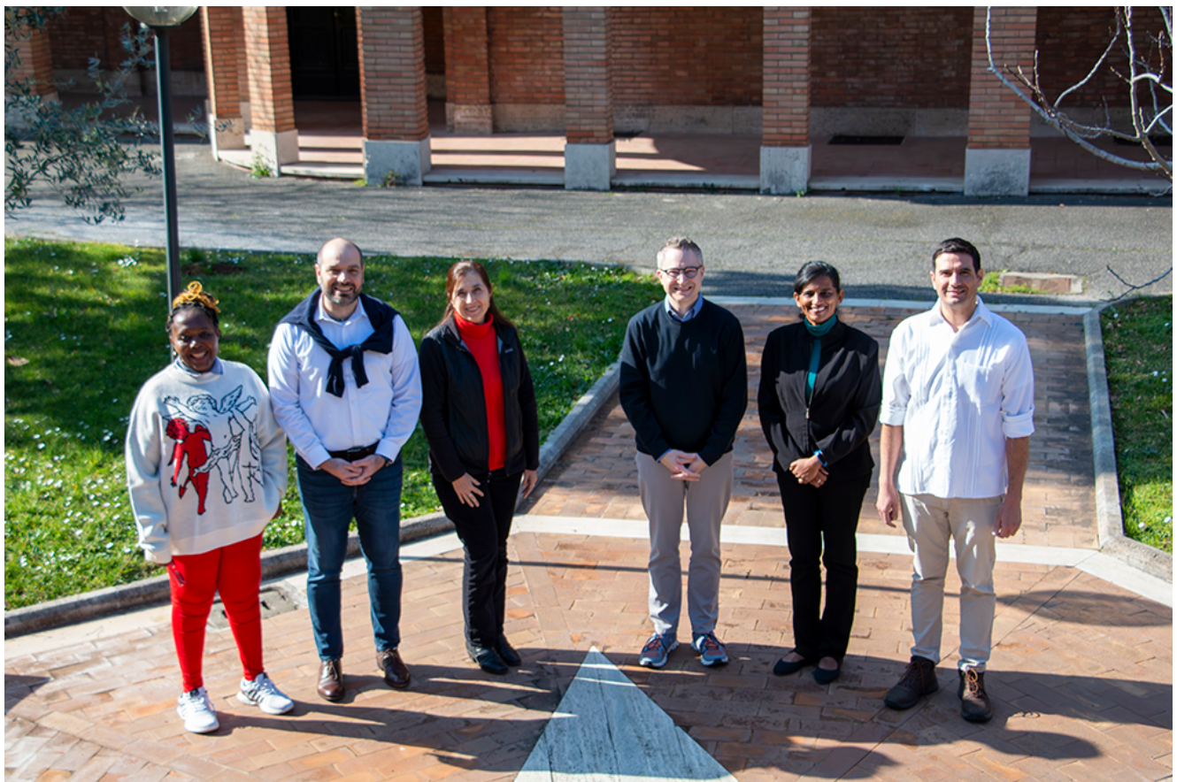
International Council for Lasallian Association and the Educational Mission (CIAMEL)